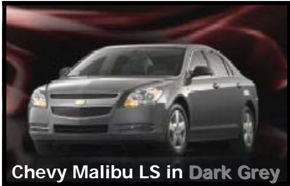
Chevy Malibu LS in Dark Grey