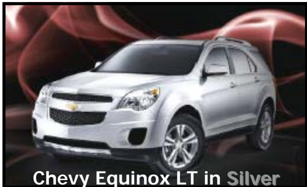
Chevy Equinox LT in Silver