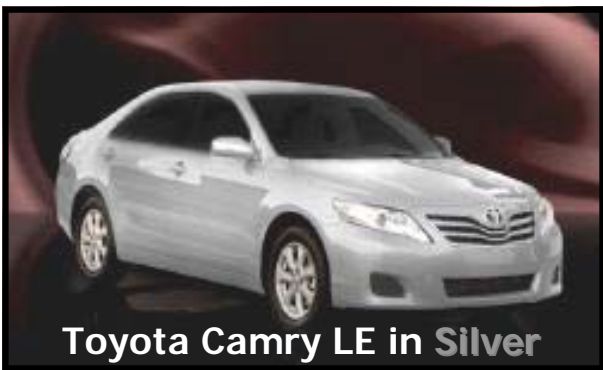
Toyota Camry LE in Silver