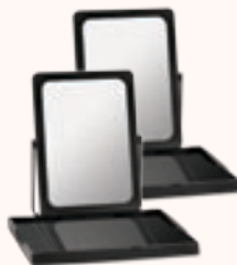
Two Mirrors With Trays