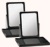
Two Mirrors With Trays