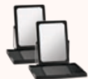
Two Mirrors With Trays

To qualify, your initial order must be received and accepted by the Company in the same or following calendar month as your Independent Beauty Consultant Agreement.