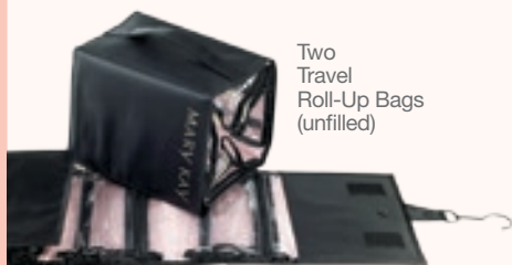
Two Travel Roll-Up Bags (unfilled)

Plus , earn a BizBuilder Bucks $80 wholesale product credit.**