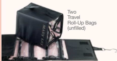
Two Travel Roll-Up Bags (unfilled)

Plus , earn a BizBuilder Bucks $125 wholesale product credit.**