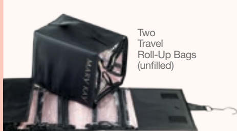
Two Travel Roll-Up Bags (unfilled)

Plus, earn a BizBuilder Bucks $50 wholesale product credit.**