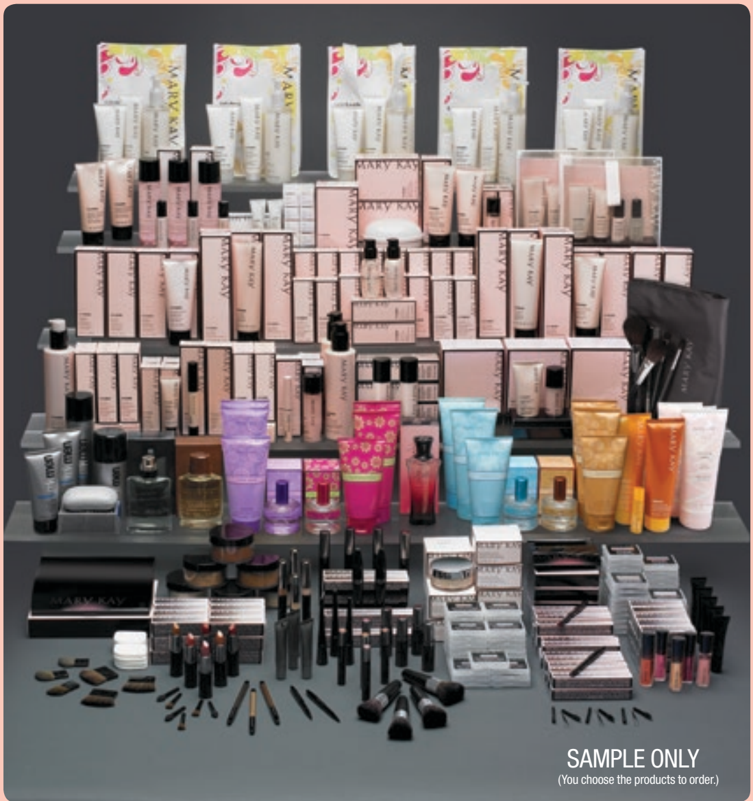
SAMPLE ONLY (You choose the products to order.)

The Company reserves the right to change or update products and packaging. Please go to the Mary Kay InTouch ® website for the most up-to-date information.