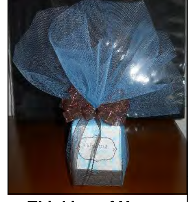
Thinking of You Wrap up blue & brown tulle. Tie with brown bow.

Thinking of you Set Glue dot lotion & fragrance on 5+x 7+ frame. Tie up with cello. Bow & adorn.