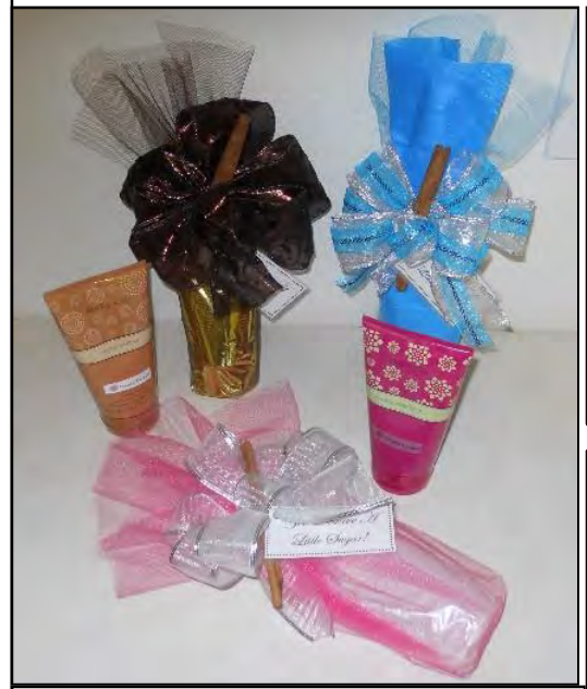
You Deserve Some Sugar: Tie up a sugar scrub with a cinnamon stick. Attach a tag with ‰ou Deserve Some Sugar.+