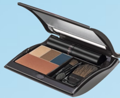
Color Compact (unfilled) $18