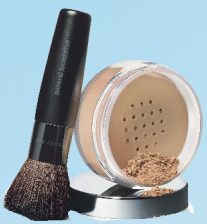
Mineral Foundation Set $28