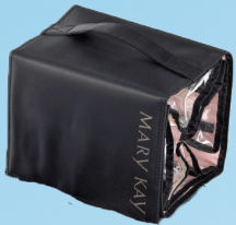
Travel Rollup Bag $35