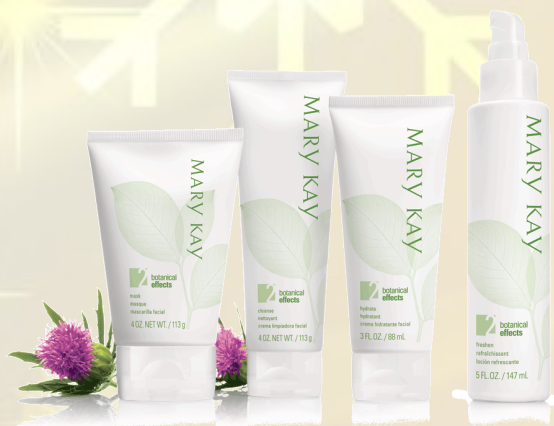
Botanical Effects Set $58 Cleanser Mask Freshener Moisturizer