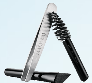
Mary Kay Brow Tools $4