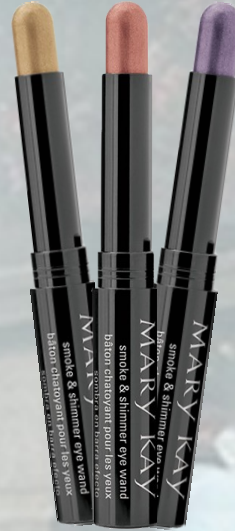
Limited Edition Smoke and Shimmer Eye Wand $14 Amethyst Smoke Golden Illusion Enchanted Mauve