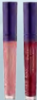
Limited Edition Mary Kay Glossy Lip Stain $16 Enchanted Mauve Mulberry Forest