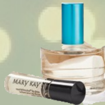
Cool & Crisp $34 Simply Cotton Eau de Toilette Icicle Nourishine Lip Gloss