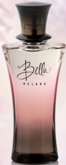
Bella Belara Eau de Parfum $38