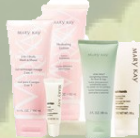
All Over Hydration Set $58 2 in 1 Body Wash & Shave Hydrating Lotion Satin Lips Lip Balm Satin Hands Hand Cream Mint Bliss Lotion for Legs & Feet