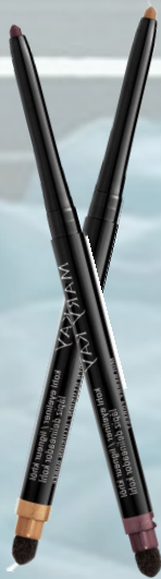
Limited Edition Mary Kay Kohl Eyeliner $16 Mulberry Forest Golden Illusion