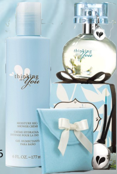
Thinking of You Set $55 Eau de Parfum Moisture Rich Shower Gel Eau de Parfum Pendant