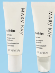
Satin Lips Set $18