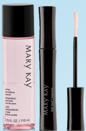
Lash Love Mascara & Eye Makeup Remover $30