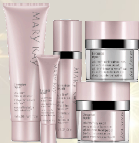
Timewise Repair Set $199 Foaming Cleanser Lifting Serum Day Cream Sunscreen Broad Spectrum SPF 30 Night Treatment with Retinol Eye Renewal Cream