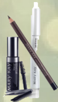
Beautiful Brows $62 Mary Kay Lash & Brow Building Serum Brow Gel, Brow Definer Pencil in Brunette & Brow tools