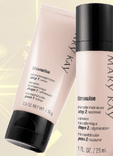
Timewise Microdermabrasion Set $50 Step 1 Refine Step 2 Replenish