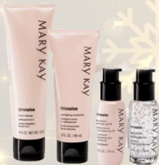
Timewise Miracle Set $90 Normal/Dry or Combination/Oily Cleanser, Moisturizer Day Solution and Night Solution