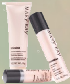
Timewise Trio $110 Timewise Firming Eye Cream Moisture Renewing Gel Mask Replenishing Serum-C