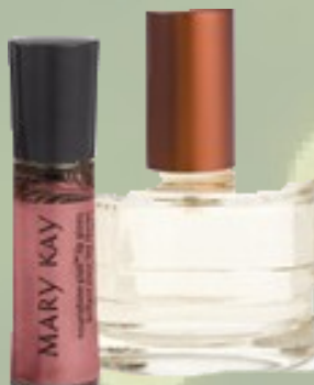
Warm & Wonderful $34 Warm Amber Eau de Toilette Café au Lait Nourishine Lip Gloss