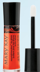
NouriShine Lip Gloss $14